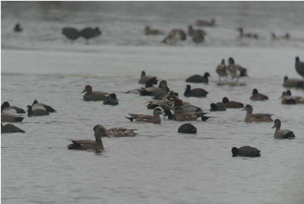
Assorted waterfowl on Lake Wausau, April 22, 2013

Hopefully 2014 will be another great year of birding on Lake Wausau, and will bring many good bird sightings so all us the local birders can get excited!