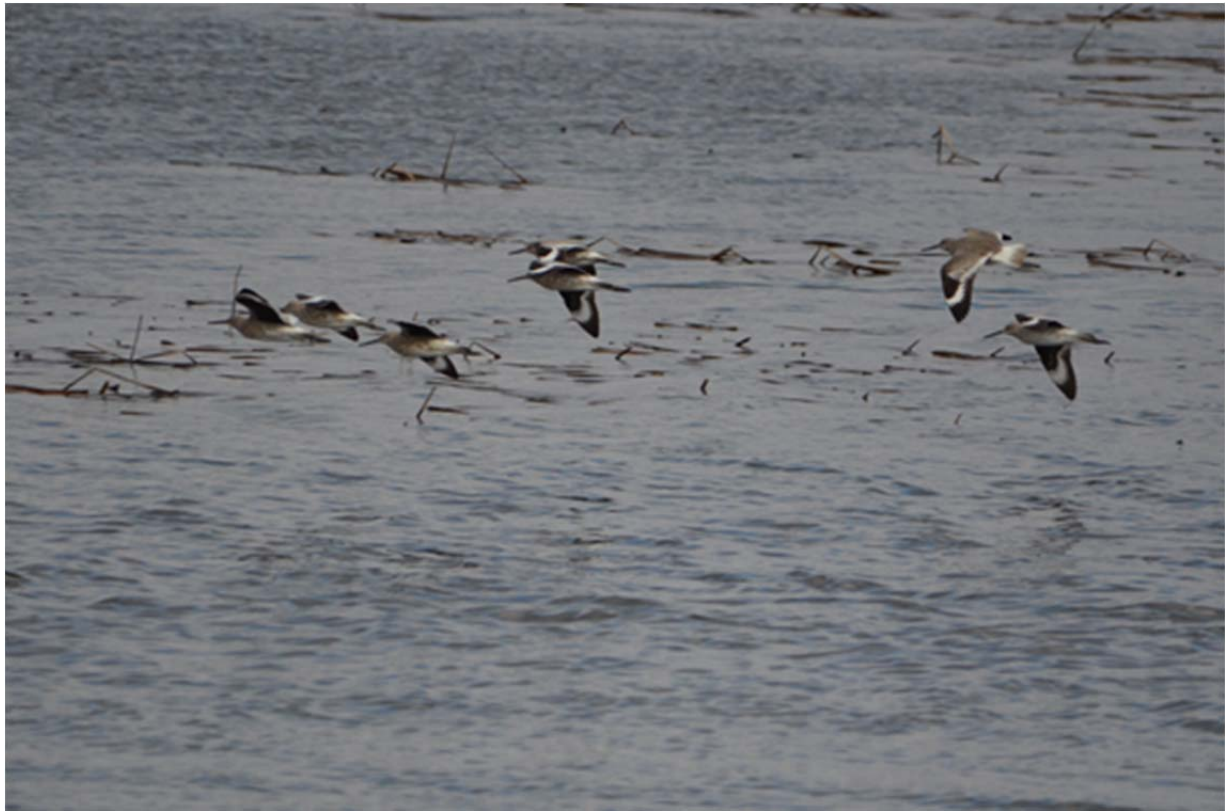
Willets in flight, east of causeway on Lake Wausau, April 29, 2013, photo by Myles Hurlburt