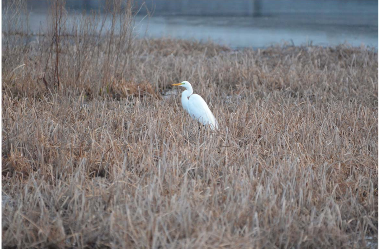
Great Egret on north end of Lake Wausau, May 5, 2013

rebounded again. But, somewhat like the previous sighting, these two birds only stayed until May 5 th when we did not see them after that. If these were the pair that nested last year in the rookery, and they did so again in 2013, then they somehow went undetected by us local birders.