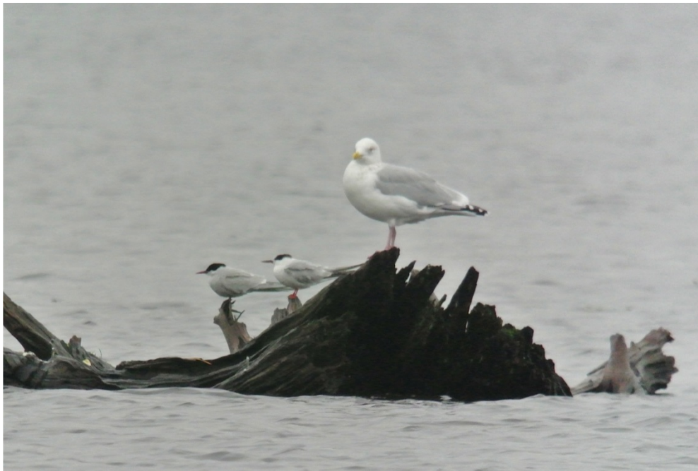
Arctic Tern (on left), October 5, 2013, Lake Wausau