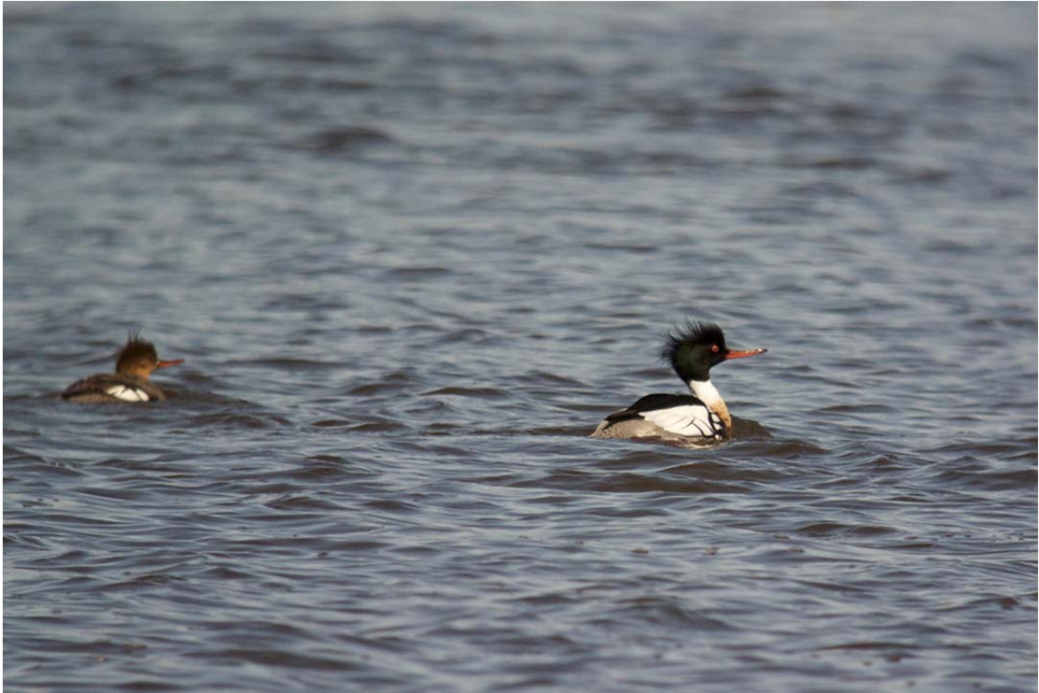
Red-breasted Mergansers on Lake Wausau, April 20, 2013, photo by Myles Hurlburt