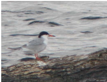
Forster's Tern by Dan Belter, Lake Wausau, late April of 2013