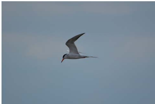
Forster's Tern in flight on Lake Wausau, April 29, 2013, photo by Myles Hurlburt

Shorebirds were also present in 2013. Many of the sighting occurred on the little sandbar located to the west of the Osprey nesting platform. The variety was not as good in 2013 as it was 2012, but we did have three locally good species for 2013. Species present in 2013 included; Killdeer , Spotted Sandpiper , Willet (already mentioned above), Lesser Yellowlegs ,