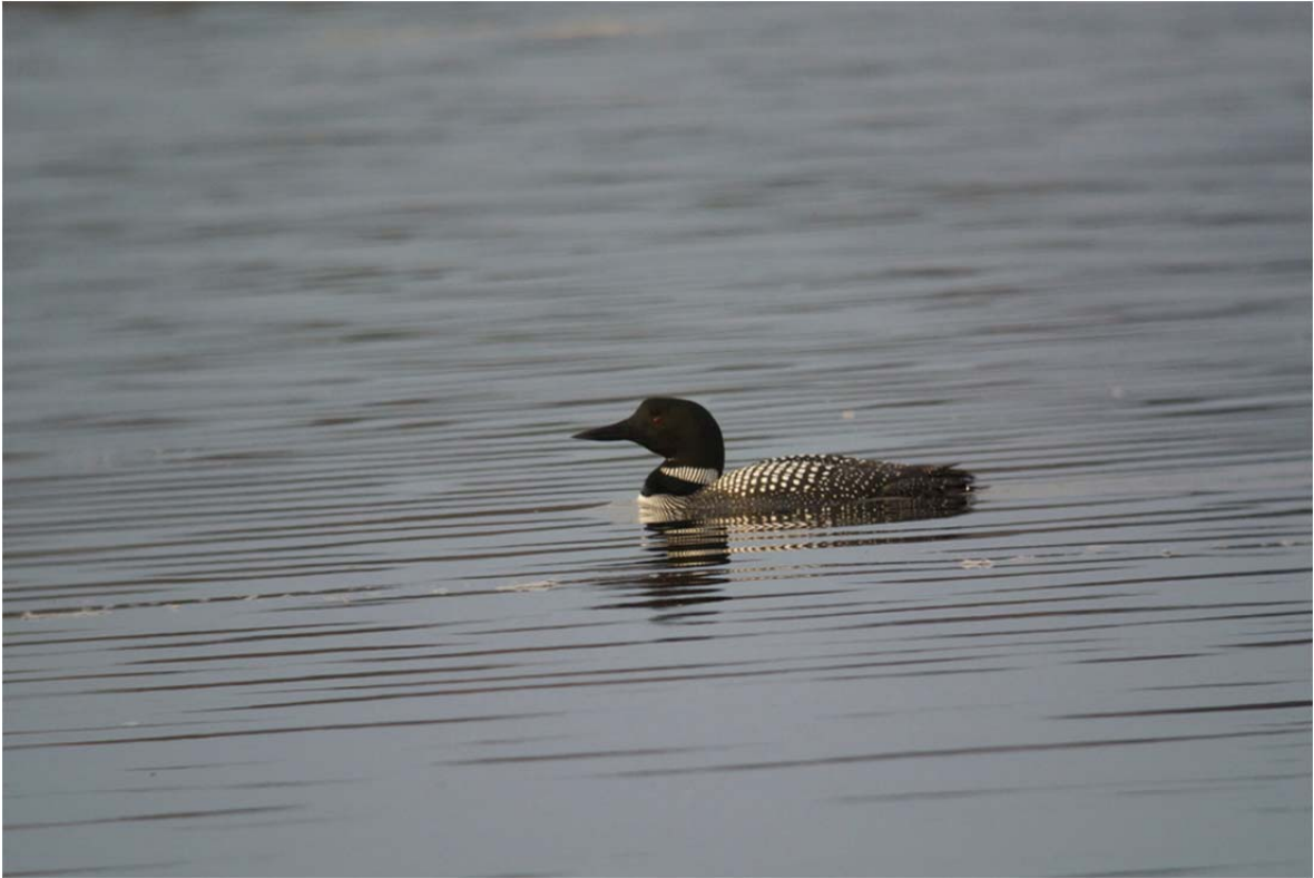
Common Loon on Lake Wausau, April 14, 2013