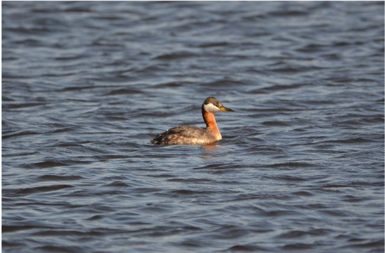
Red-necked Grebe on Lake Wausau, April 16, 2013

from an area along Country Club Road where we can view the south end of the lake. On April 23 rd , an impressive number of 22 birds were sighted in several areas around the lake. This is the largest number of birds I have ever had of this species on a single day in all my years of birding on Lake Wausau. The last spring migrants were seen on May 4 th . As for fall migrants, November 2 nd , 6 th , and 19 th were the sighting dates. Two birds were sighted on the 2 nd at Radtke Park, while single birds were present on both the 6 th and 19 th at Everest Park.