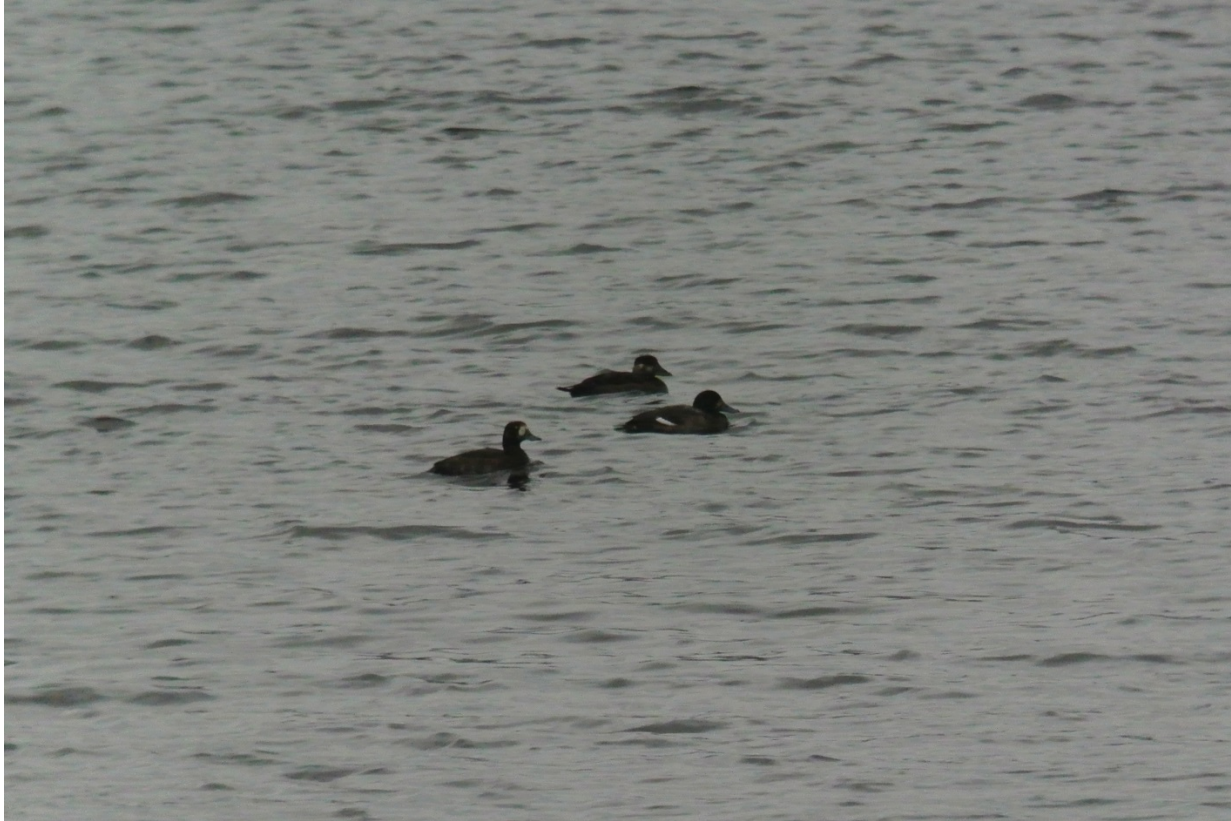
Surf Scoter (middle back) and two Greater Scaup, November 11, 2013, Radtke Park, Lake Wausau

Both White-winged and Surf Scoters made appearances in October and November. The first White-winged Scoter sighting was reported on October 5 th at D.C. Everest County Park, and again on November 11 th at the same location. A Surf Scoter first showed up at D.C. Everest County Park (a.k.a. Everest Park) on October 6 th , and then another one made an appearance at Radtke Park on November 11 th . As far as I know, no more than one individual scoter of either species was seen on Lake Wausau this fall.