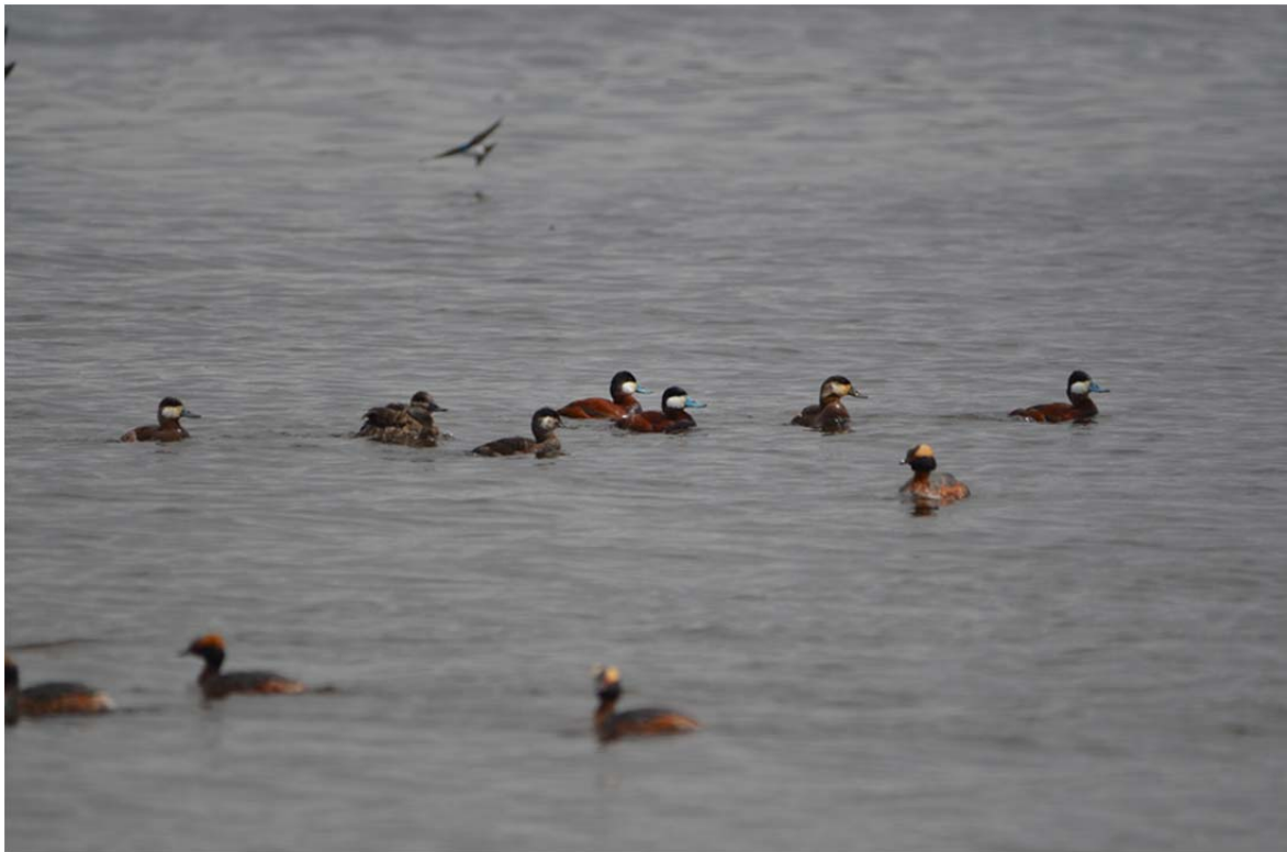
Ruddy Ducks and Horned Grebes on Lake Wausau, April 25, 2013