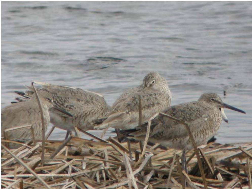
Willets, photo by Dan Belter, April 29, 2013, Lake Wausau